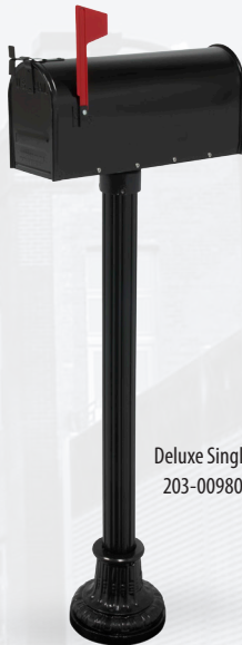
Deluxe Single 203-00980