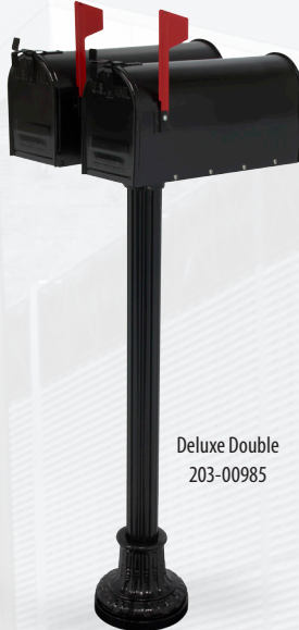
Deluxe Double 203-00985