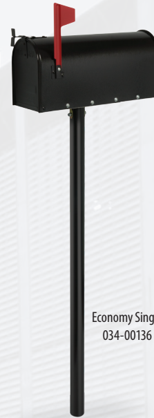
Economy Single 034-00136