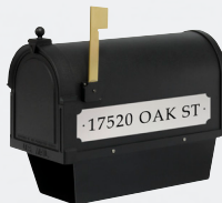
Optional address panel shown

Aluminum cast body with cast aluminum one-piece door that latches magnetically. Newspaper holder. 19 3/4" L x 9" W x 16" H. 18 lbs.