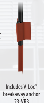
Includes V-Loc® breakaway anchor 23-VR3

Double includes: (2) Mailboxes 7" W x 19" L x 9" H, mounting bracket, powder coated black 2 3/8" round steel pole and V-Loc® breakaway pole anchor