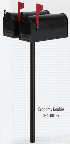
Economy Double 034-00137