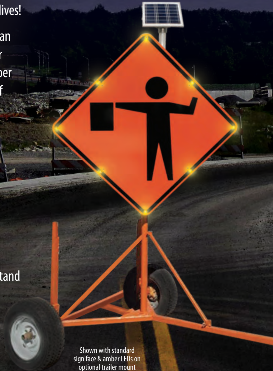
Shown with standard sign face & amber LEDs on optional trailer mount