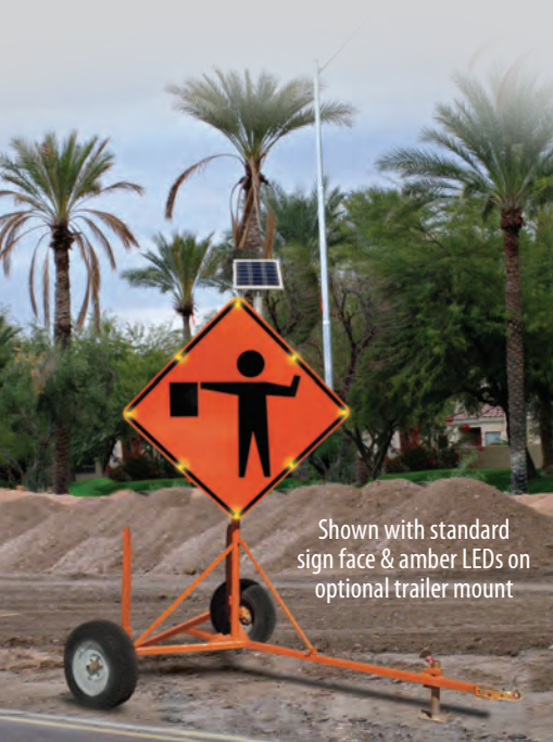
Shown with standard sign face & amber LEDs on optional trailer mount