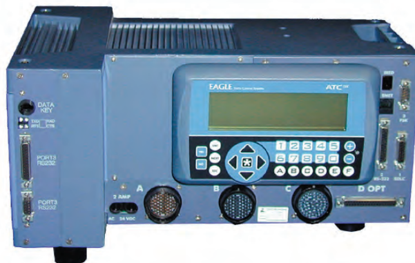
EAGLE EPAC M52 TS-2, Type 2 Controller w/ Datakey™ Card (optional)

The M50 Series Controller Unit has a removable LCD alphanumeric backlit display unit (8-line · 40 char/line). Programming is easy and error free using English Language Menus. Within a menu, each parameter can be viewed and a cursor moved to that parameter for changes. Related parameters are visible simultaneously, making verification an easy matter. The screen provides both programming area identification and editing prompts. The M50 can also be utilized as a master control unit using SE-MARC Master software.