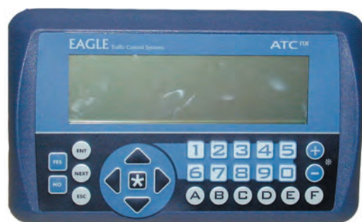
Removable Hand-held Display

Controller assemblies with TS-2 Monitors provide additional diagnostic data to the Controller Unit via the SDLC port.